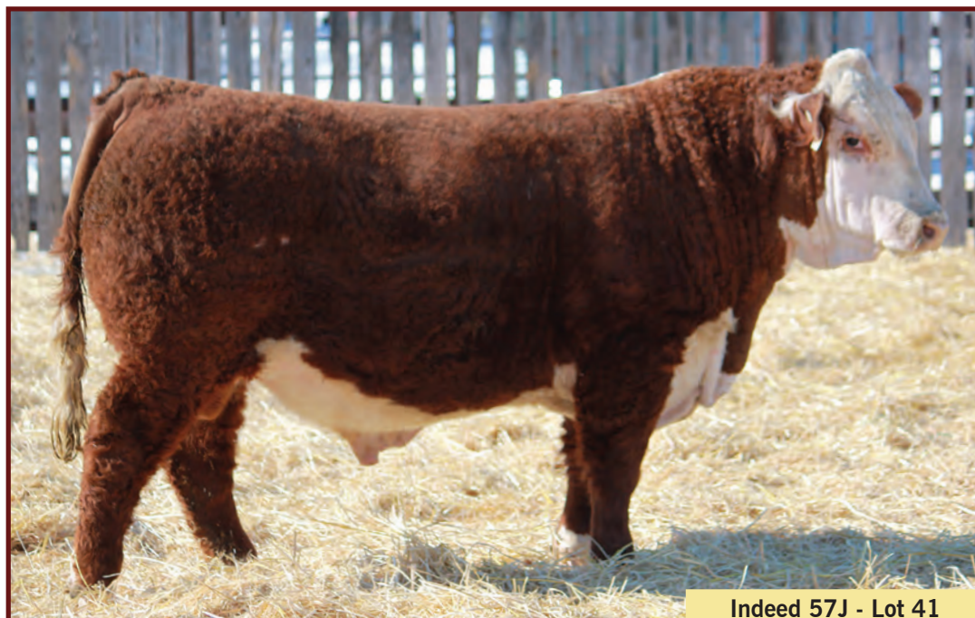
Indeed 57J - Lot 41