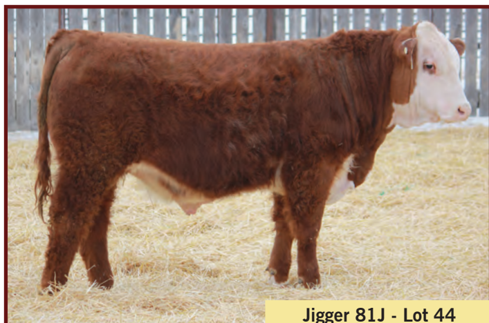
Jigger 81J - Lot 44