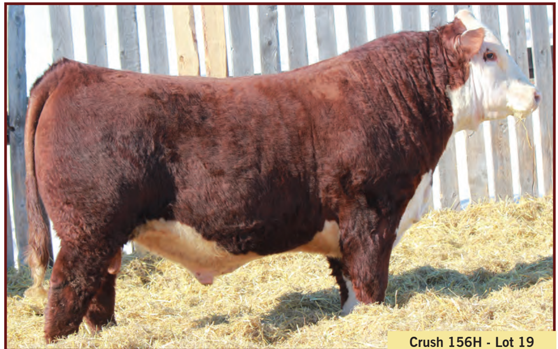
Crush 156H - Lot 19