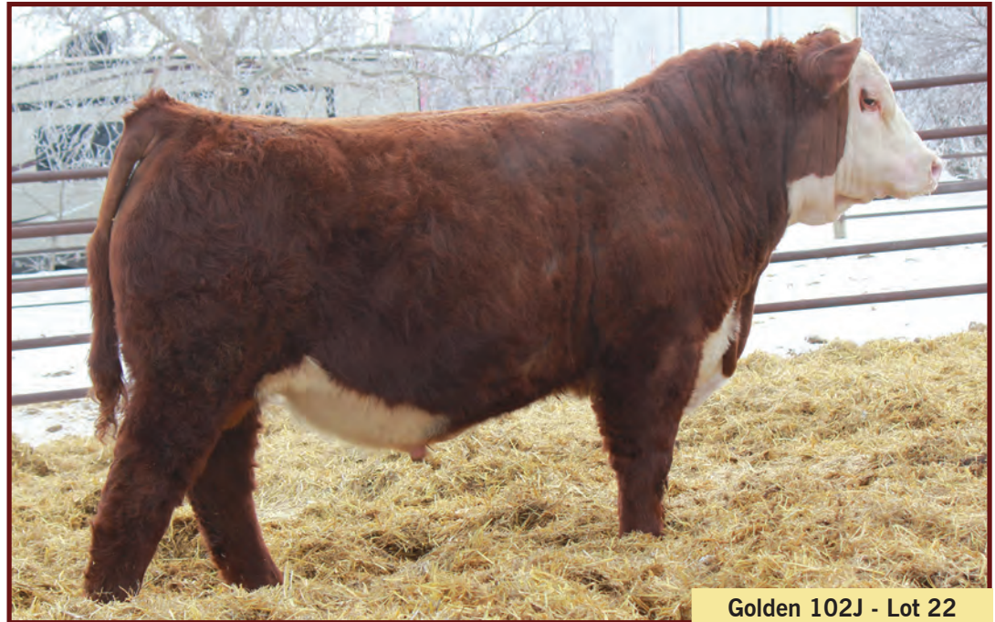
Golden 102J - Lot 22