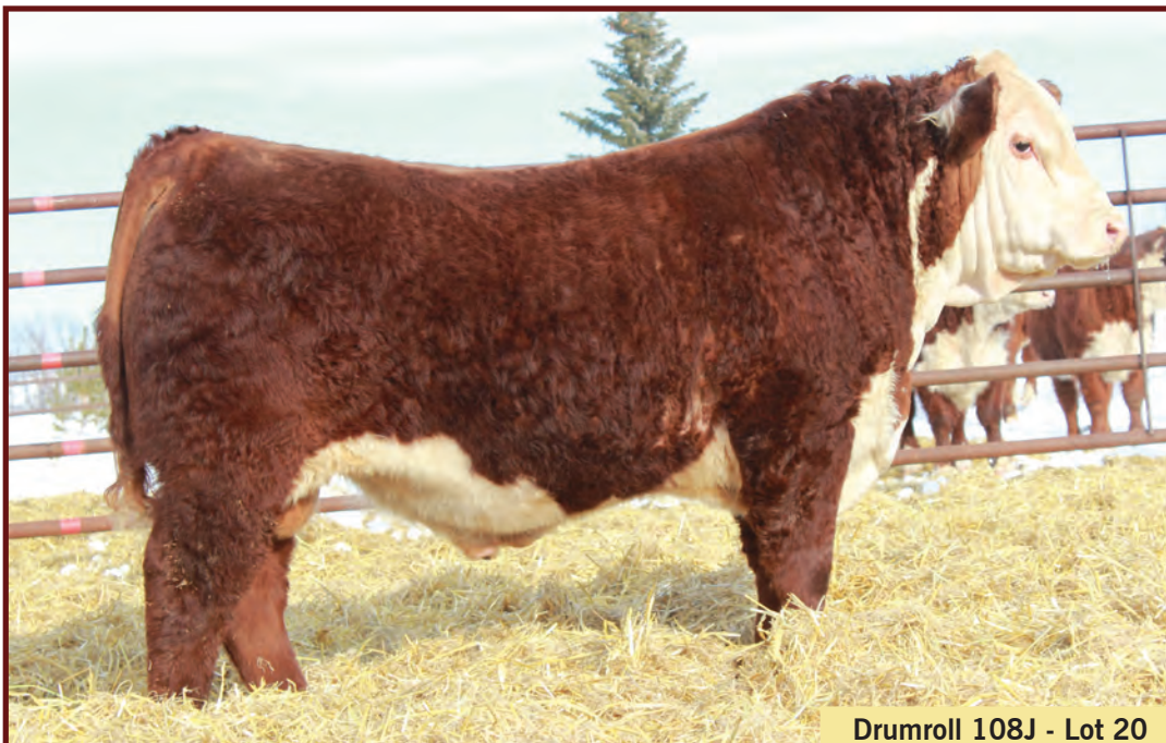
Drumroll 108J - Lot 20

Drumroll 108J is long sided and stout with style to burn. His Dam, 102F, is out of the Heidi cow family, one of the best ever at Blair Athol. 108J stood in our Agribition string last fall for a good reason!