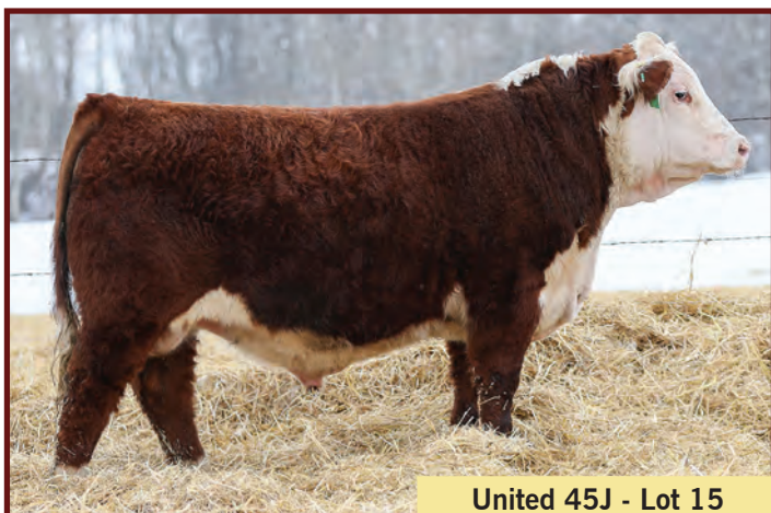
United 45J - Lot 15