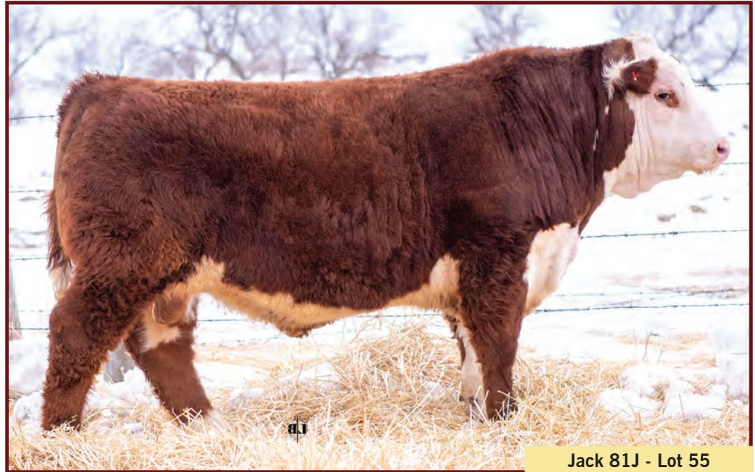
Jack 81J - Lot 55

"DEEP" is the first word that comes to mind. He is a rugged made, wide-based, deep bodied, haired up powerhouse. Remitall Belmont on the top side and going back to the old RU Galaxy on the bottom this guy is sure to add pounds and performance.