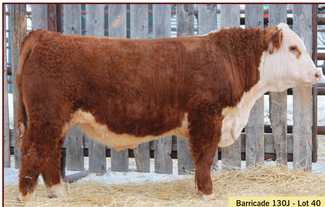
Barricade 130J - Lot 40