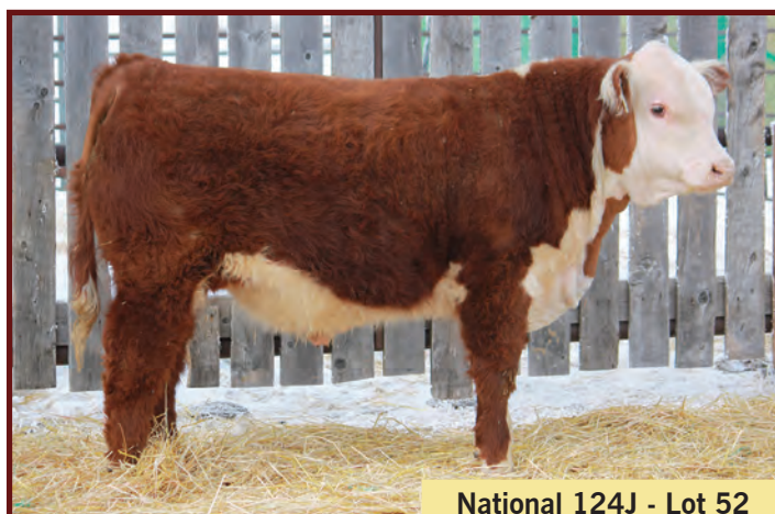
National 124J - Lot 52