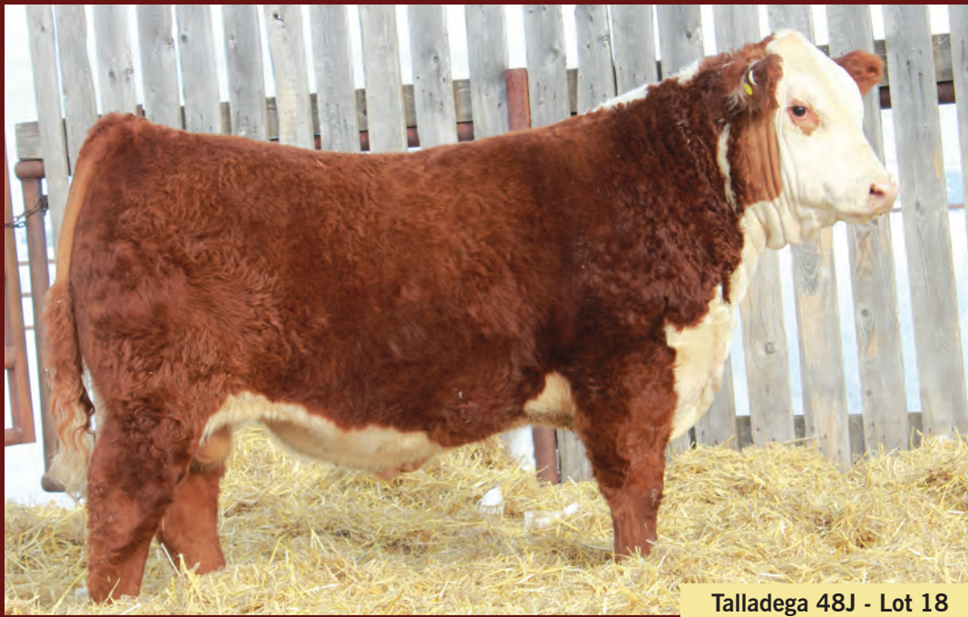
Talladega 48J - Lot 18