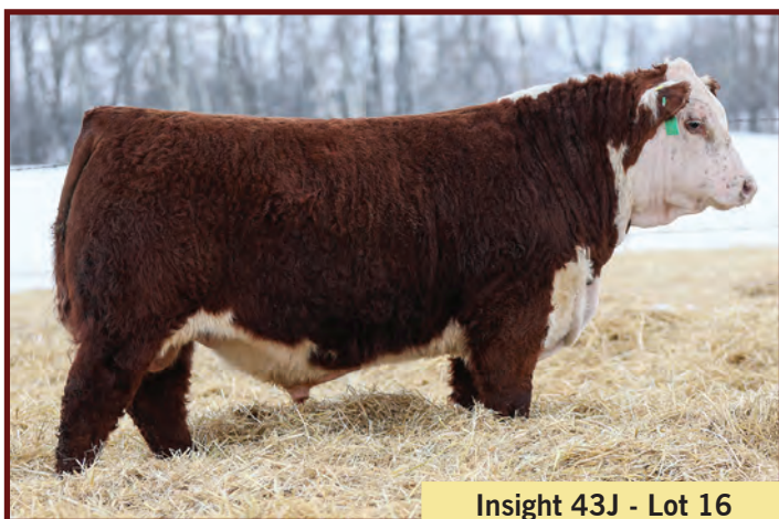
Insight 43J - Lot 16

This United son is real big middled and deep sided. His mother is a typical Tahoe daughter, sound and good uddered.