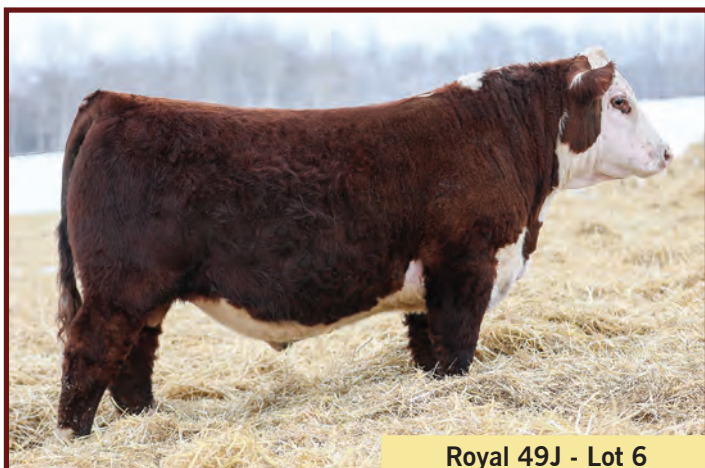
Royal 49J - Lot 6

Here is a real complete made Redzone son. He's got the length and style, yet does not disappoint when you get behind him. His mother is a beautiful young cow and really did a great job on this guy.