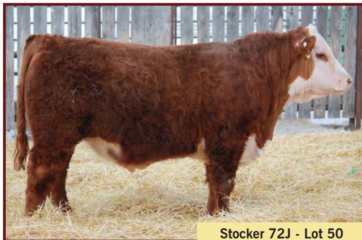
Stocker 72J - Lot 50