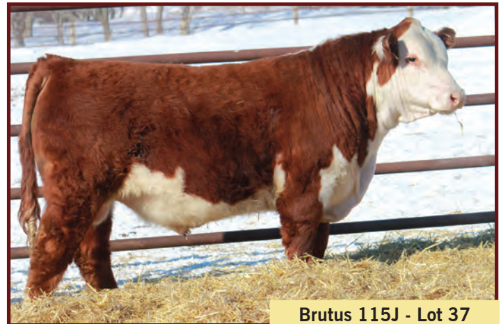
Brutus 115J - Lot 37