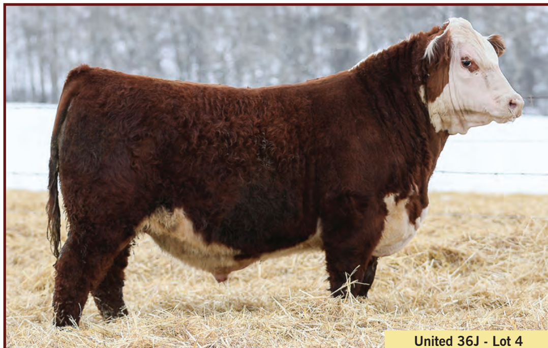
United 36J - Lot 4

Another United son with that added middle and spring of rib. This bull is long sided and stout made. His mother has been an excellent producer and is still going strong.