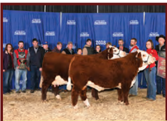
Cameo Girl - Dam