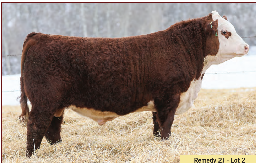
Remedy 2J - Lot 2

CHURCHILL RED BULL 200Z BLAIR'S NELLIE R117 ET 5B MHPH 521X ACTION 106A JJPH 512R 83T KOVI 116Y