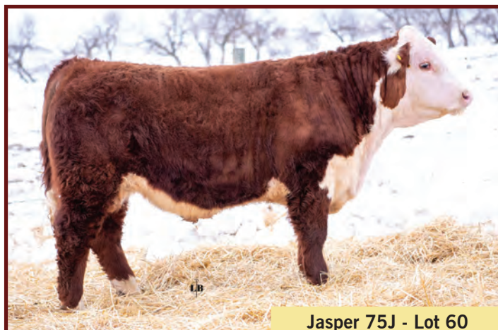
Jasper 75J - Lot 60