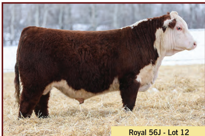
Royal 56J - Lot 12

A really complete made Royal son. He's an easy doing bull with a big back and lots of shape from behind. Royal has been doing a tremendous job siring both sexes. Loads of maternal strength here.