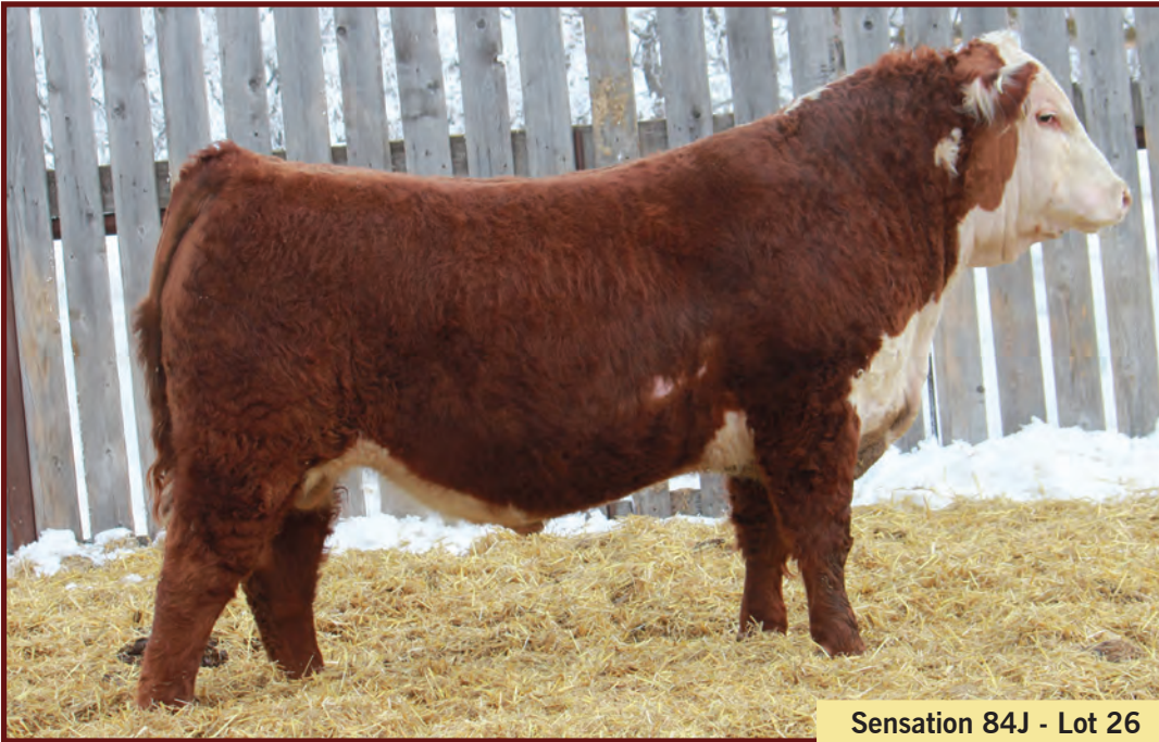
Sensation 84J - Lot 26