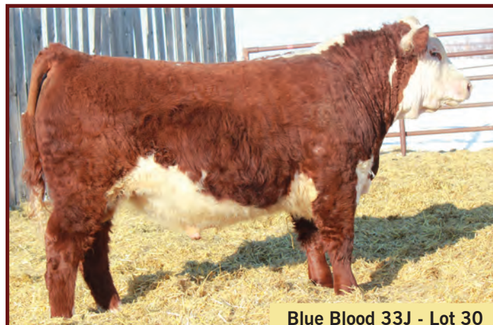
Blue Blood 33J - Lot 30