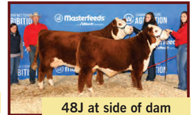
48J at side of dam