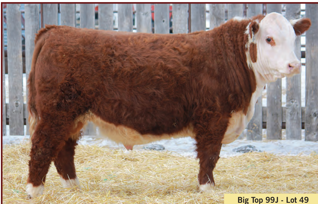
Big Top 99J - Lot 49

TH 122 71I VICTOR 521X ET MHPH 301W DAINITY 205Y MHPH 101S UMPIRE 118U PCL QUEEN MAKER 36N ET 9U