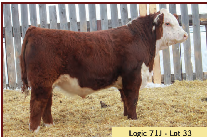
Logic 71J - Lot 33