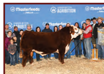
Game On 69H - Maternal Brother