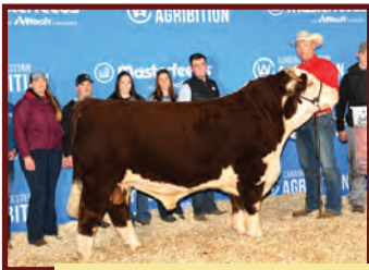
DVL 107H - Maternal Brother

Lots of performance and length here. Maybe one of the most impressive structured bulls in our group. 80J's dam, 101D, is headed for the Donor pen this spring. When I say this cow is perfect uddered, I'm hardly doing it justice, she's worth coming to look at. First son sold to Ramsay's from Sinclair Manitoba. 80J and his maternal brother 107H were both at Agribition in November, where 107H was Reserve Junior Champion. Put this guy with the cows and expect some extra pounds at weaning time.