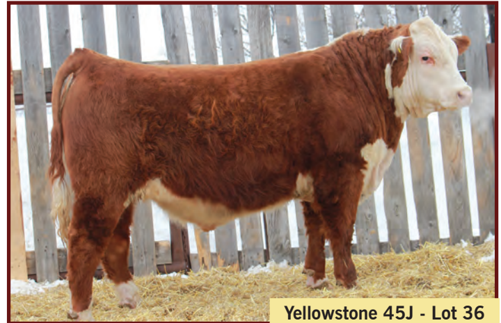
Yellowstone 45J - Lot 36