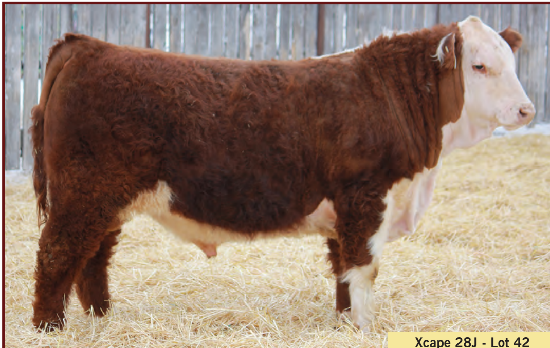
Xscape 28J - Lot 42

SHF WONDER M326 W18 ET NJW P606 72N DAYDREAM 73S WLB ELI 10H 83T GRH 30S ABBY 35U