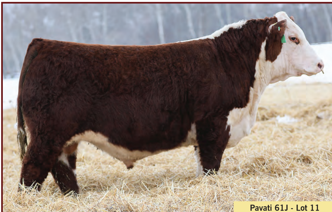
Pavati 61J - Lot 11

SHF TAHOE R117 T100 HAROLDSON'S 37H MIRA ET 62K NJW FHF 9710 TANK 45P REMITALL MARVEL 190S