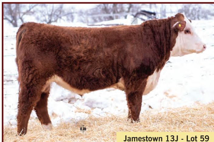
Jamestown 13J - Lot 59