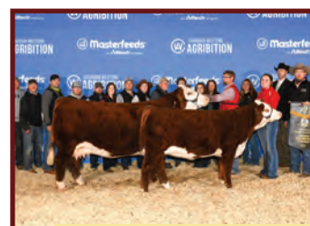
Reva 32F - Maternal Sister

A real genetic opportunity here! This is the maternal brother to our 2021 Agribition Champion Female and Miss World Champion Female!!