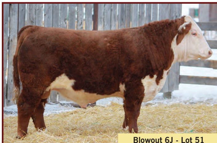
Blowout 6J - Lot 51