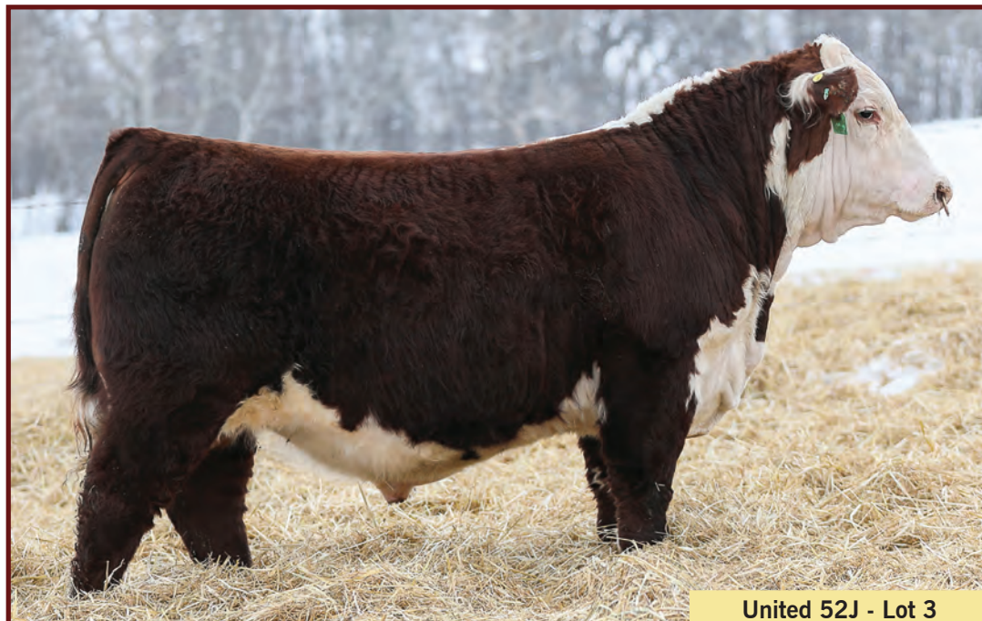
United 52J - Lot 3