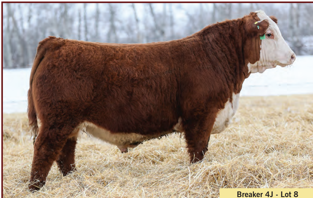
Breaker 4J - Lot 8

I really like this Pilgram son. He has a lot of shape down his top and is explosive in his hip and stifle. He is very correct in his structure and is very sound made. There are a lot of productive cows in this pedigree.