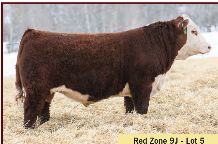
Red Zone 9J - Lot 5