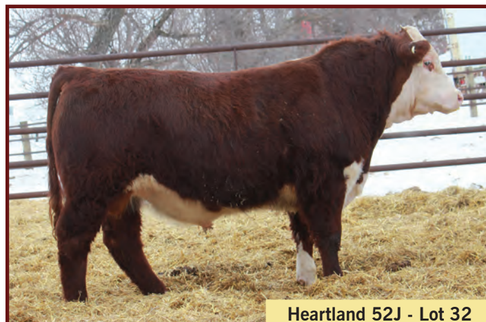
Heartland 52J - Lot 32