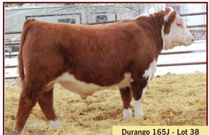
Durango 165J - Lot 38