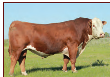
McCoy 53A Patent 124E - Sire of lots 19 -23 and the Grandsire to lot 18