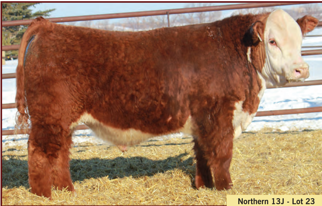
Northern 13J - Lot 23

SHF TAHOE R117 T100 HAROLDSON'S 37H MIRA ET 62K BLAIR-ATHOL 20X JAZZ ET 26Y HAROLDSON'S MARTINE 45P 22X