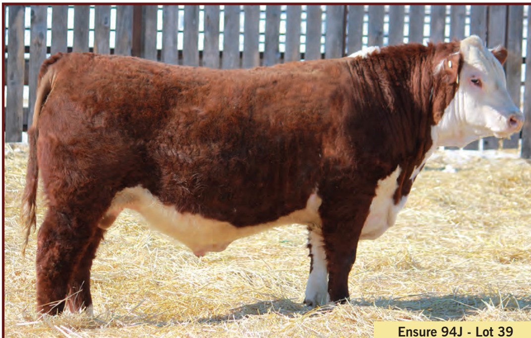
Ensure 94J - Lot 39