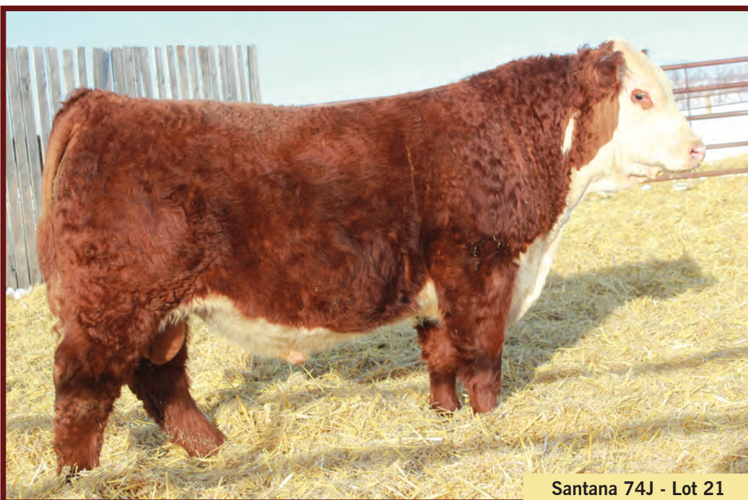
Santana 74J - Lot 21

Santana 74J is a definite fan favorite at Blair Athol. Lots of middle and muscle shape, and a Herd Bull look through his head. His Dam, 142D, is a great young cow with the kind of udder you'd like to see on every cow you own. You won't miss him sale day, make sure the staff doesn't miss your bid!!