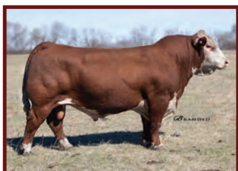
Humbolt 1F - Sire