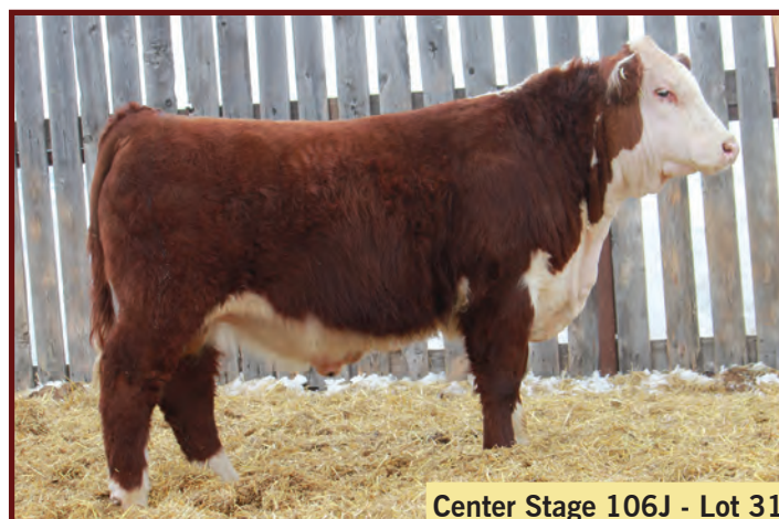
Center Stage 106J - Lot 31