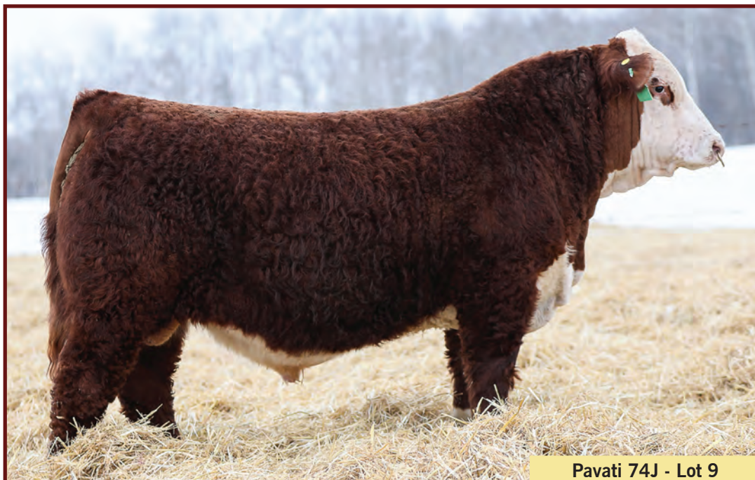
Pavati 74J - Lot 9

I really like this red necked, red eyed Pavati son. He is a real stout made individual with lots of middle and depth of flank. He's big butted and looks like a herd bull.