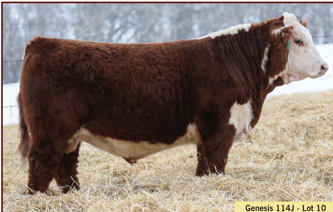
Genesis 114J - Lot 10

If you are looking for some fresh genetics take a look at this guy. He is a half-brother to the $245,000 Media bull, who made quite a stir last fall. Take note that this is just an April bull. He is big bodied and stout made with excellent testicular development for his age.