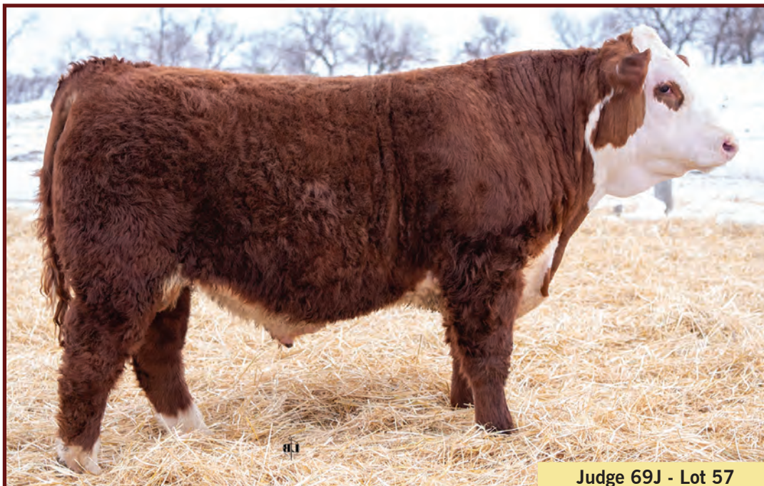
Judge 69J - Lot 57