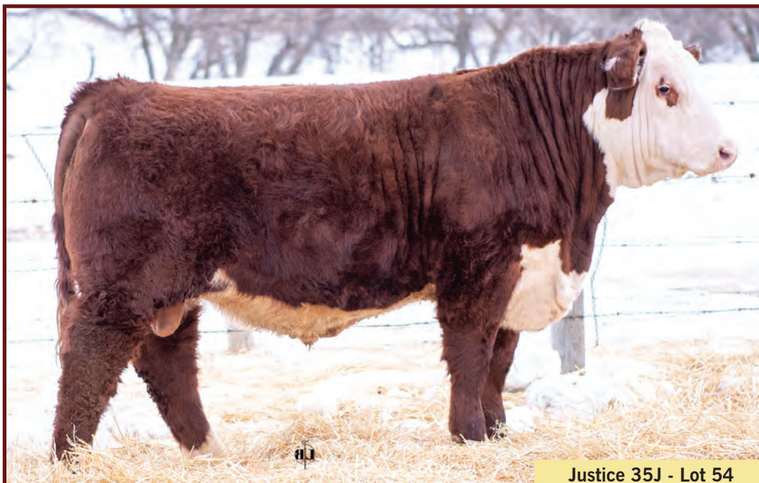
Justice 35J - Lot 54

REMITALL SUPER DUTY 42S SQUARE-D NADIA 323P SQUARE-D REPORT 593R SQUARE-D SERENA 295U