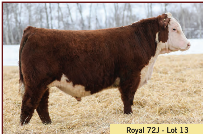
Royal 72J - Lot 13

Here is another Royal bull with that extra middle and shape. His mother is a powerful high performing Tahoe daughter.