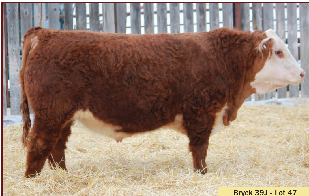
Bryck 39J - Lot 47

TH 122 71I VICTOR 719T TH 7N 45P RITA 71U SQUARE-D TUSCON 362T CLAYRIDGE ELSIE 42U