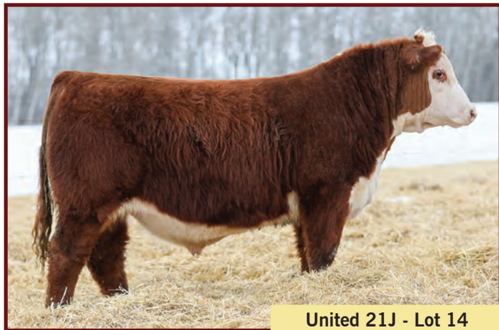
United 21J - Lot 14

This United son is very long bodied with some extra growth. He has great cosmetics and will definitely add some hair to his offspring. Extra calving ease with this individual.