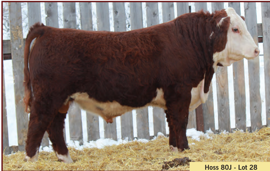
Hoss 80J - Lot 28

Lots of performance and length here. Maybe one of the most impressive structured bulls in our group. 80J's dam, 101D, is headed for the Donor pen this spring. When I say this cow is perfect uddered, I'm hardly doing it justice, she's worth coming to look at. First son sold to Ramsay's from Sinclair Manitoba. 80J and his maternal brother 107H were both at Agribition in November, where 107H was Reserve Junior Champion. Put this guy with the cows and expect some extra pounds at weaning time.