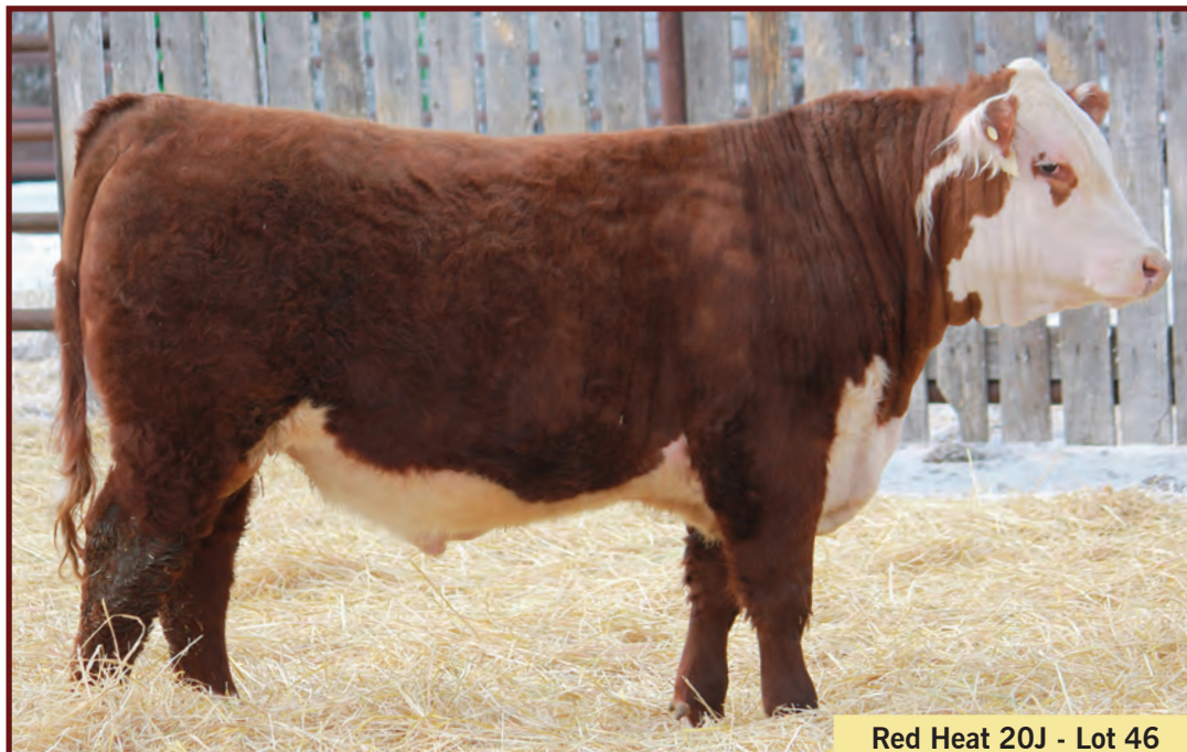
Red Heat 20J - Lot 46