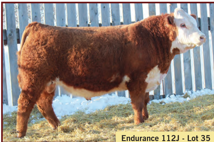
Endurance 112J - Lot 35