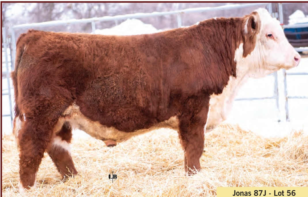
Jonas 87J - Lot 56

REMITALL KEYNOTE 20X RU 10A ELM 57E DUSTY-DEE P183 DUALY 36A SQUARE-D SUSIE 662Y