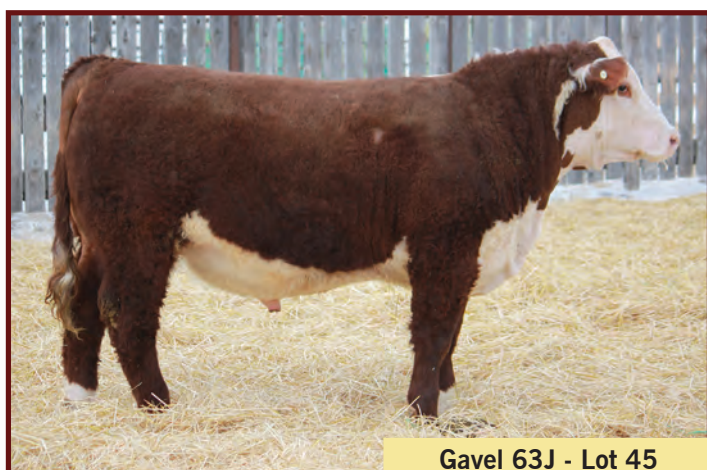
Gavel 63J - Lot 45