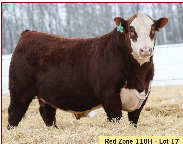
Red Zone 118H - Lot 17

Here is a well-balanced freckle faced Insight son. He is easy doing and out of a really nice young Marvel female.