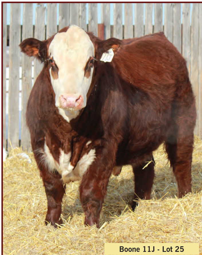
Boone 11J - Lot 25

MCCOY 55M ABSOLUTE 49S GHR SEBASTIAN 3S 26W GHC VOLUME IV ET 150S GHR NANCY 54L 11N