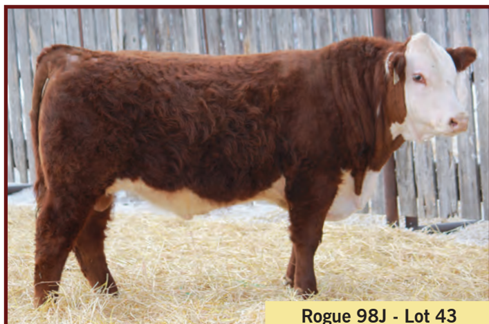
Rogue 98J - Lot 43