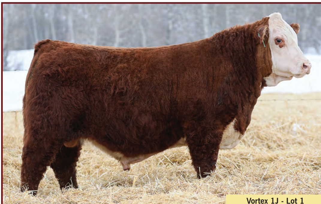
Vortex 1J - Lot 1

This Vortex son is a very high performing individual with a lot of mass and substance. Lots of hair and extra pigment on this bull. He will add pounds to your calf crop.