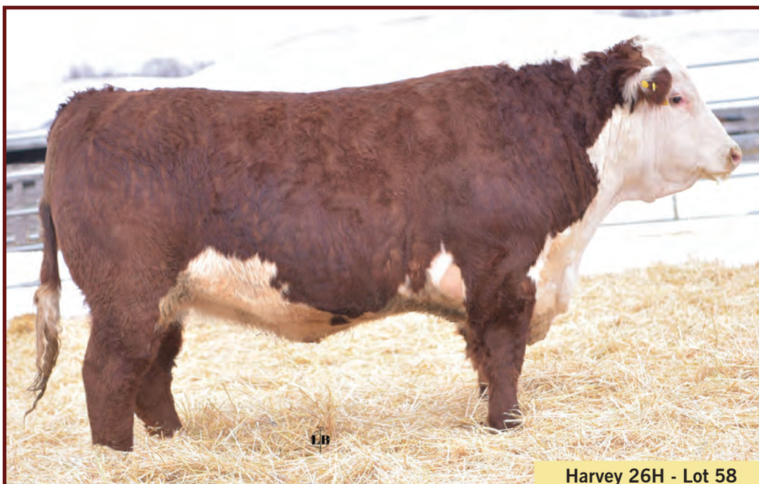
Harvey 26H - Lot 58

MHPH 101S UMPIRE 118U GHC-TABOO-TCF MISS KAREN 4T ANL 37H HARD COPY 51K C&T JANA 26D