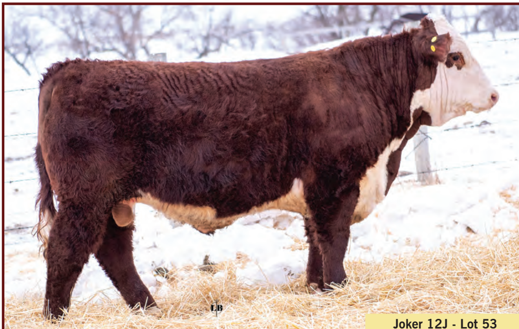
Joker 12J - Lot 53

Dark coloured. Fully pigmented and goggle eyed. Super eye appealing. Clean fronted with a nice smooth shoulder. Long sided. Great cow from the Wascana dispersal, she's broody made and big topped.