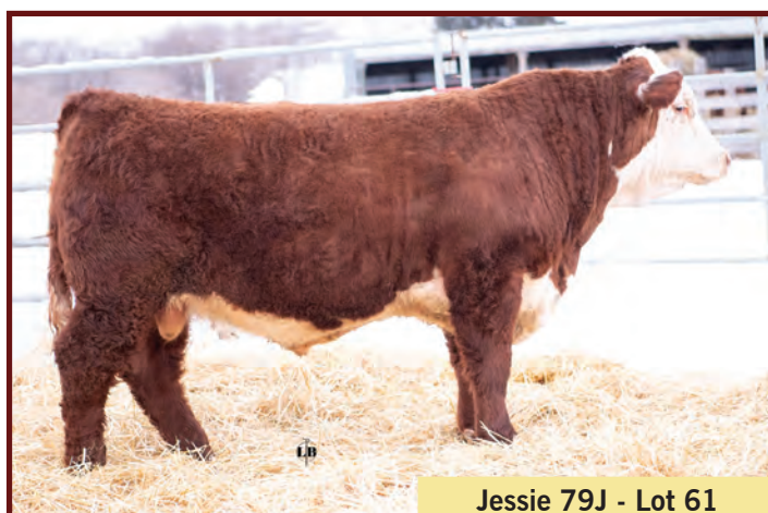
Jessie 79J - Lot 61

79J is a dark marked, red necked, red to the ground bull out of our Victoria 882F cow we purchased out of the Wascana dispersal sale. He is a moderate frame, nicely put together package. Being sired by a Stroker son is an added bonus. He is sure to produce highly maternal replacement females.