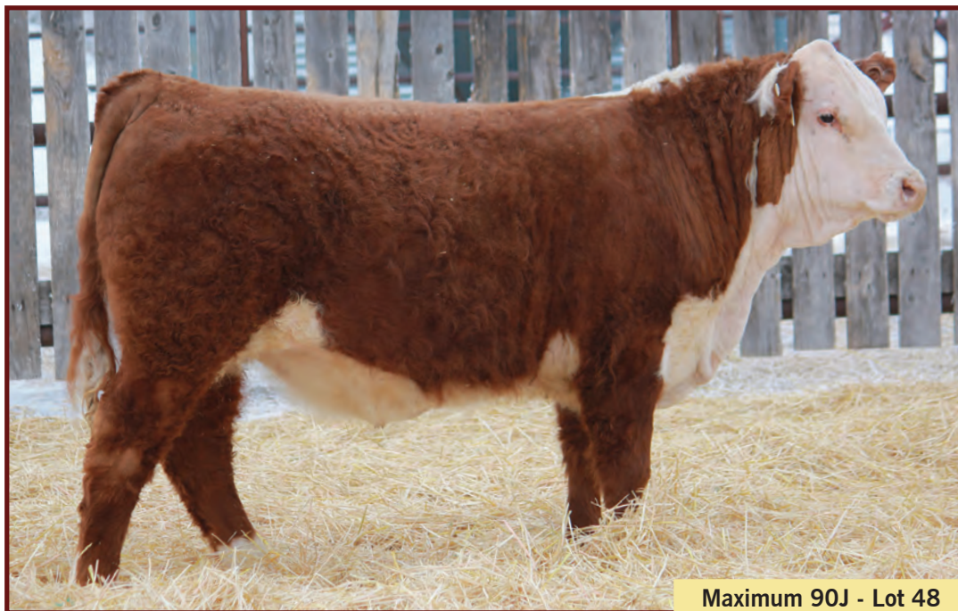
Maximum 90J - Lot 48