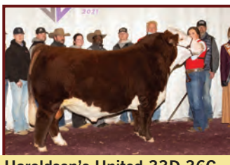
Haroldson's United 33D 36G Sire of lots 28 - 32

TH 122 71I VICTOR 719T BBSF 52U FAWN 22X BLAIR-ATHOL 60D WESTERN 25L FJELLE BRO 4E APPROVAL 740J