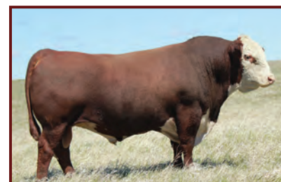
RU BA 11X Excaliber 223F - Sire of lots 24 - 27