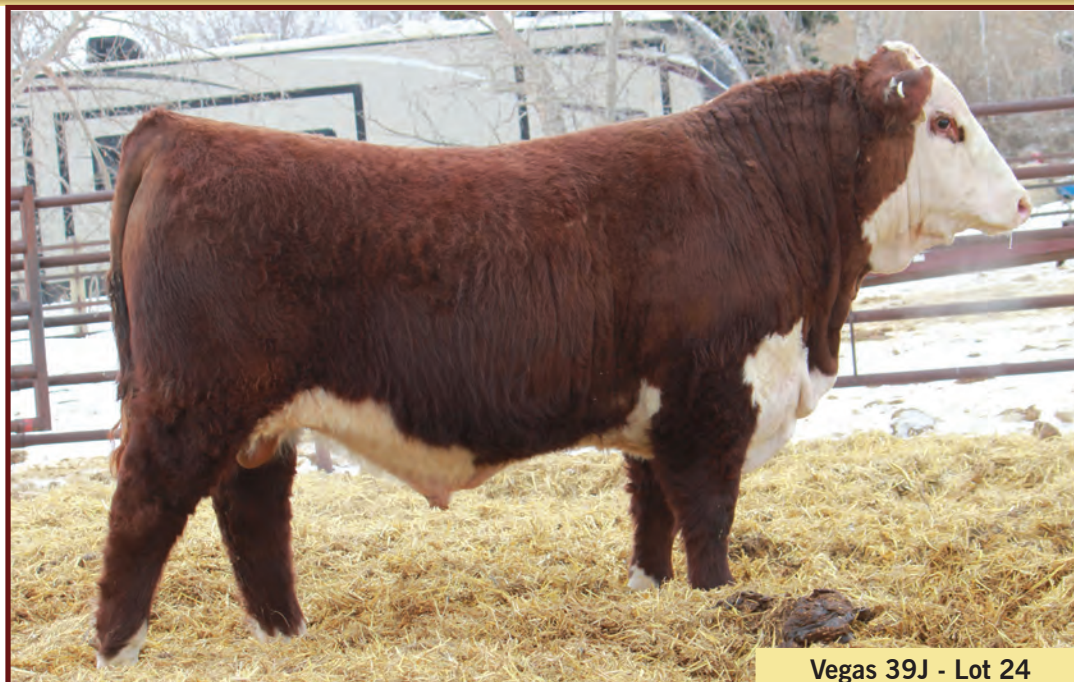
Vegas 39J - Lot 24