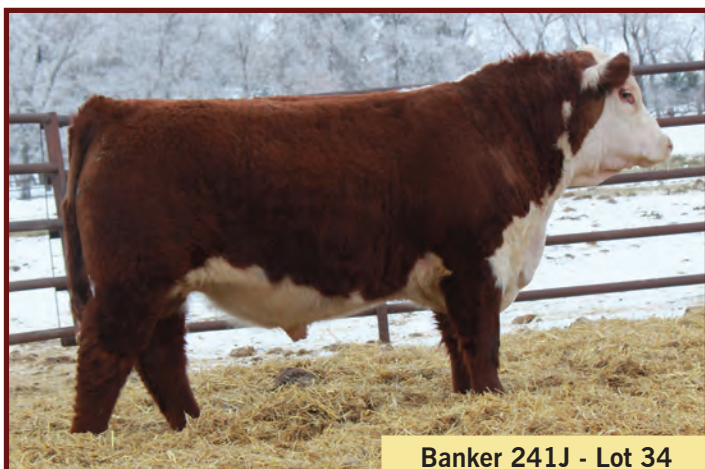
Banker 241J - Lot 34