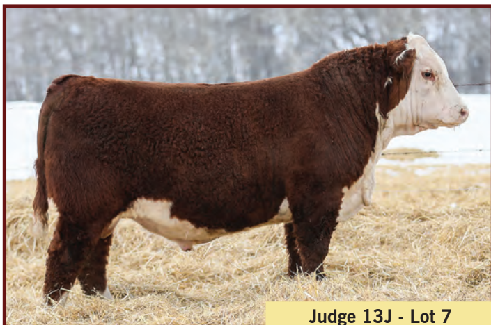
Judge 13J - Lot 7

Here is a nice moderate birth weight Royal son with some extra pigment, lots of power and maternal strength in this pedigree.