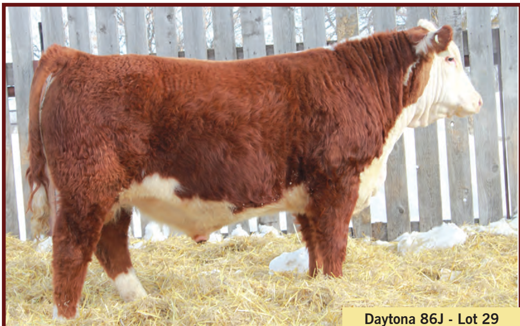
Daytona 86J - Lot 29