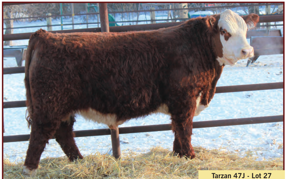
Tarzan 47J - Lot 27